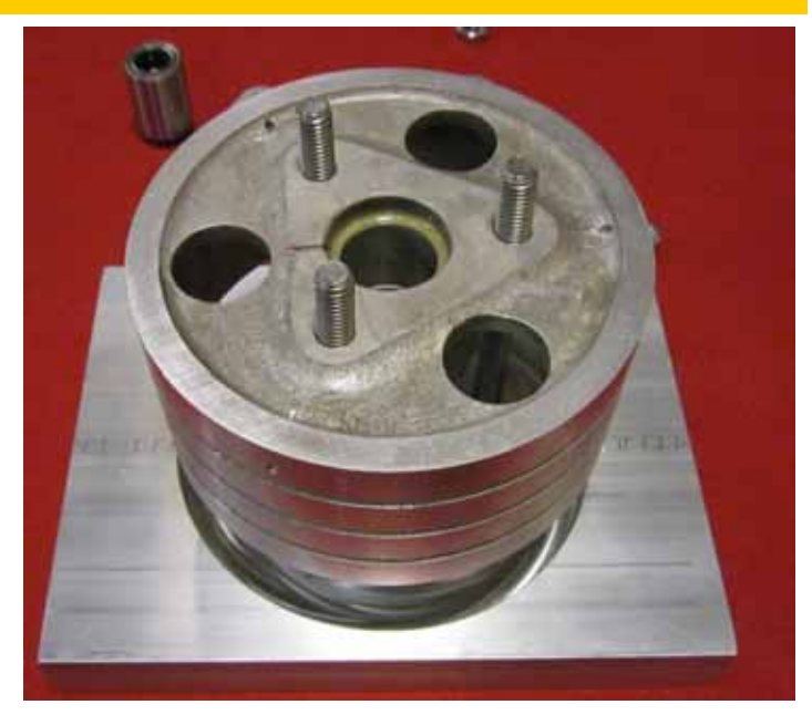
Fig 2 Slip Dashpot over bolts as shown