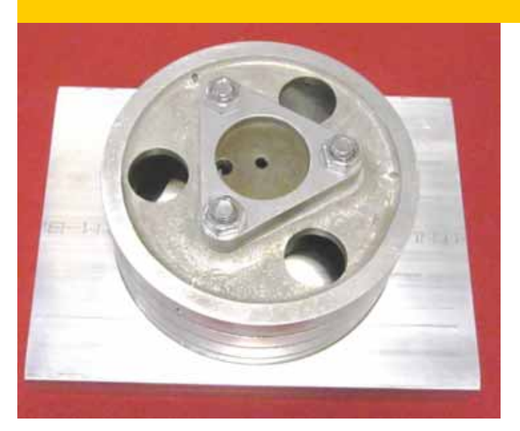
Fig 1 Remove the hex rods and place onto fixture as shown

Remove the Bleed-Wire and try to plunge the dashpot using both hands. (Figure 4) Note: It should feel like it is "Locked". If not, add oil &repeat bleeding step using more pressure on the bleed wire to open the ball check.