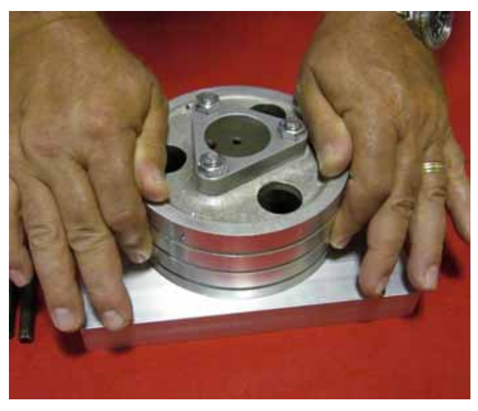
Fig 4 Verify that all air is removed from Hydraulic unit. If it is properly filled and bled, it will feel like it is stuck or locked up.