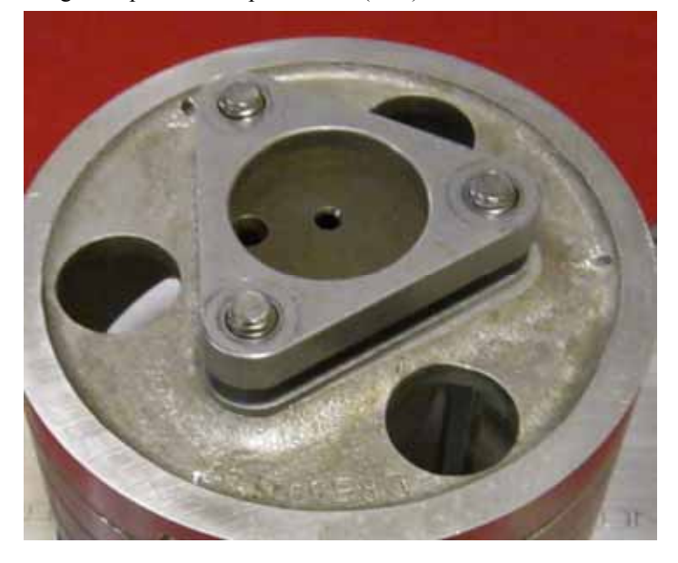
Fig 3 Slip Driver-Capture Plate over bolts as shown