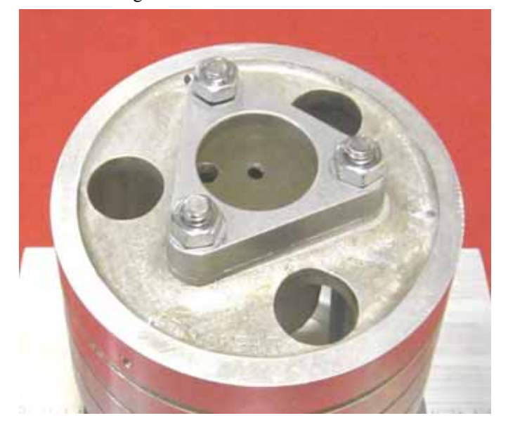
Fig 4 Screw lock-nuts on bolts (deformed thread UP) as shown