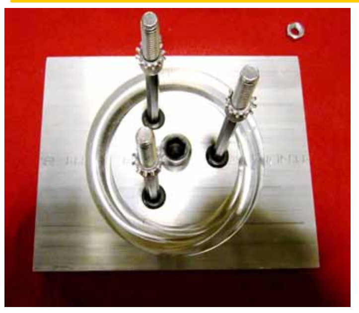
Fig 1 Place bolt and star washer onto hex extensions as shown

Confirm that lifter is seated on the internal locking in the dashpot (Figure 4)