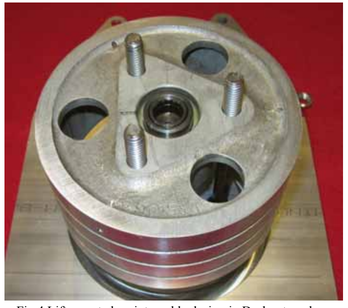
Fig 4 Lifter seated on internal lock ring in Dashpot as shown