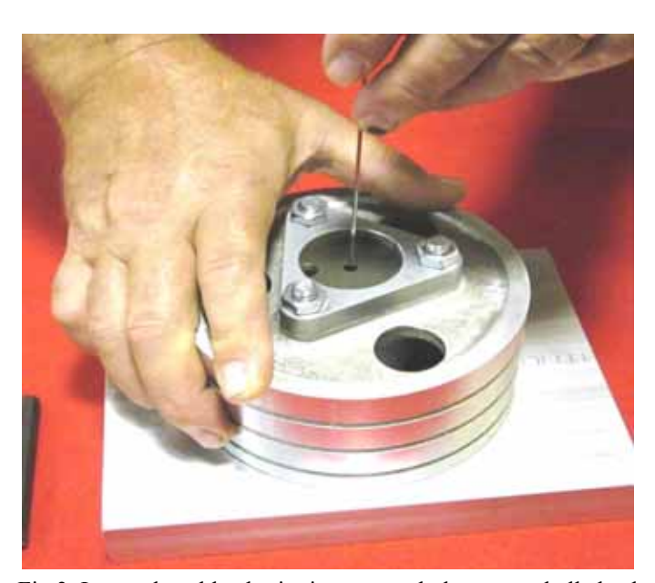
Fig 3 Insert clean bleed-wire into center hole to open ball check in the lifter unit below.