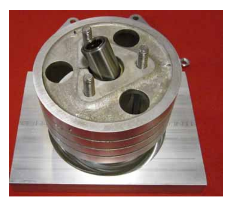
Fig 3 Slip lifter into Dashpot as shown